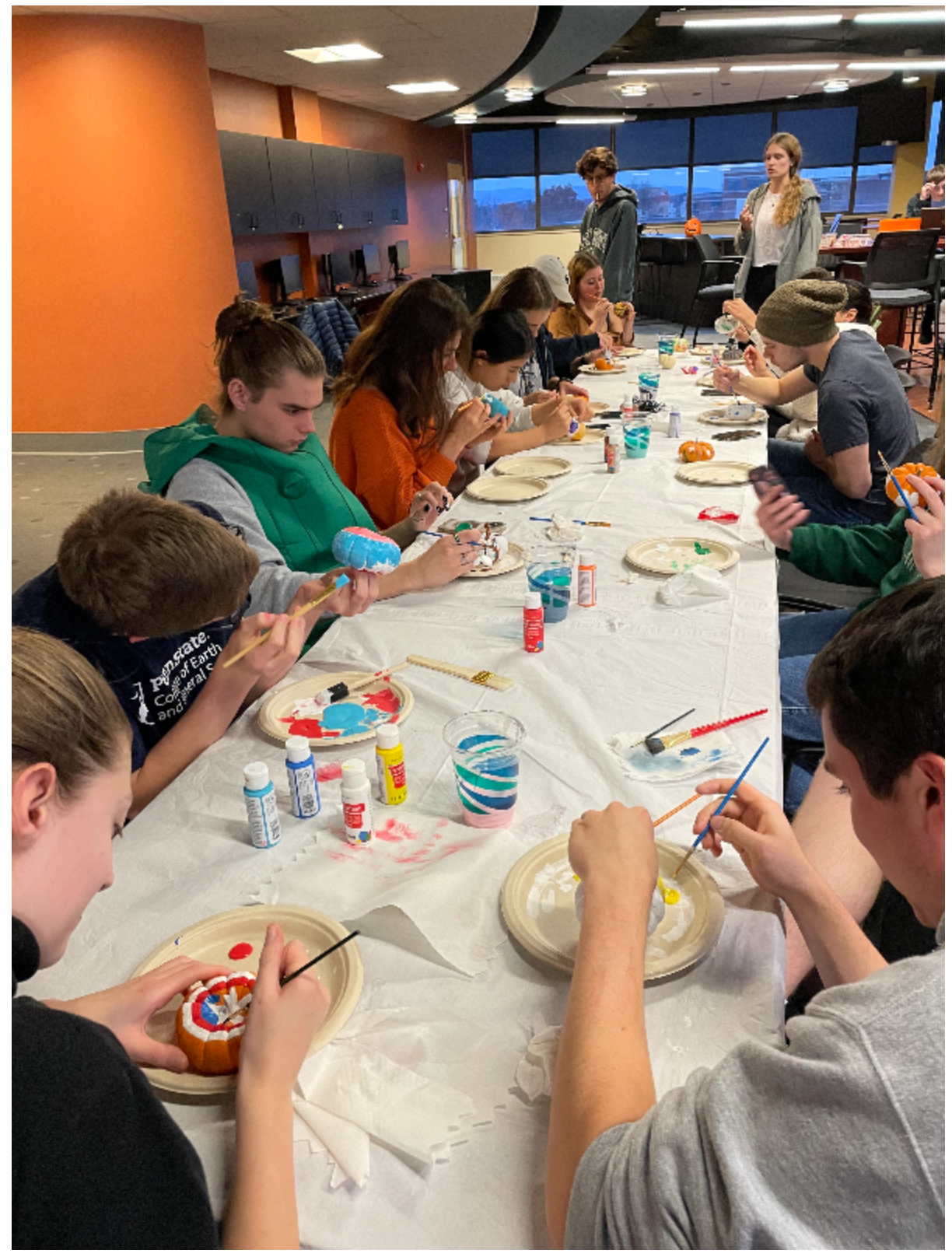
Halloween pumpkin painting at the Weather Center. (October 2022)