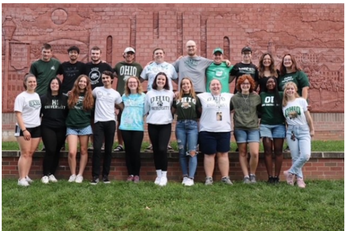
This past Fall semester, OUCAMS participated in a multitude of activities through our passion for meteorology and helping the community.