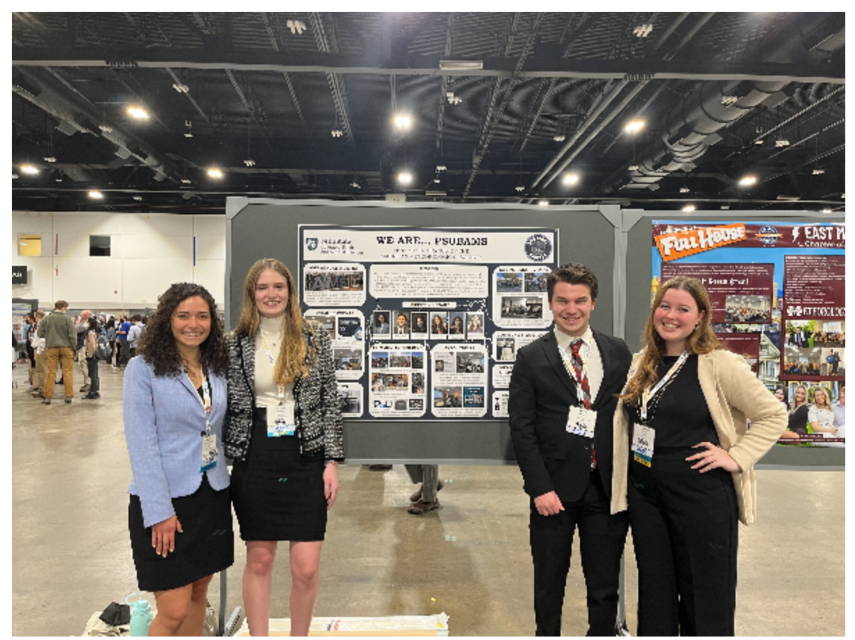
PSUBAMS Executive board with the chapter poster at the AMS Annual Meeting.

community outreach this semester and visiting nearby facilities, like the KCCX radar and the NWS State College office.