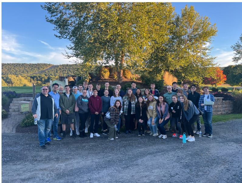
Ice cream social with AccuWeather staff.