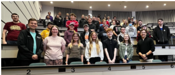
A group photo of our 2022- 2023 Millersville University AMS chapter

As we progress through autumn, the chapter is excitedly planning our attendance to the National Conference. We are hard at work fundraising and planning for this event. Several students plan to present research and other projects that they have been working on. We are also excited for those students who have been accepted as Student Assistants for the conference! The Student Conference and Annual Conference are both wonderful opportunities to learn more about the field of meteorology and make connections with those in our field who are spread all across the country.