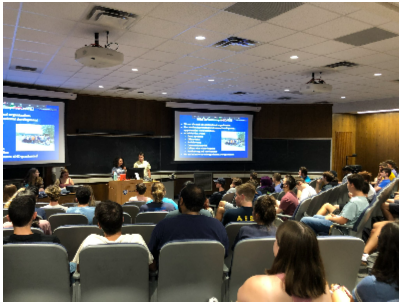
1st PSUBAMS meeting of the year

In late September, PSUBAMS had an ice cream social with staff from AccuWeather at a nearby farm. This activity allowed members the opportunity to network with AccuWeather meteorologists and learn more about what they do. Additionally, we are planning other social events for our members including an apple and pumpkin picking activity in mid October, and a pumpkin decorating event for Halloween meant to help relieve stress during the busy semester. For the rest of the fall semester, we are planning on holding a graduate school night, a NOAA Hollings Scholarship informational session, and hosting a speaker from the National Hurricane Center. We are looking forward to the AMS annual meeting and a successful rest of the semester.