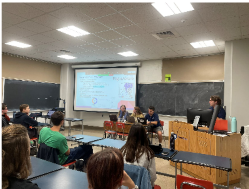
Upperclassmen share summer experiences at the Internship Night