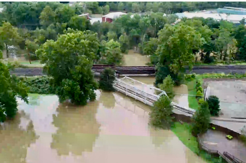
A view of the flooding at the mouth of Pike Run and the Monongahela River in California, PA.