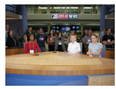
Students as future weather anchors